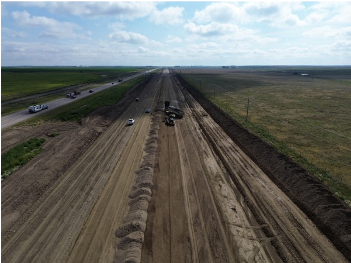
Gravel Crews Hauling and Placing Gravel Between RR 153 and 152