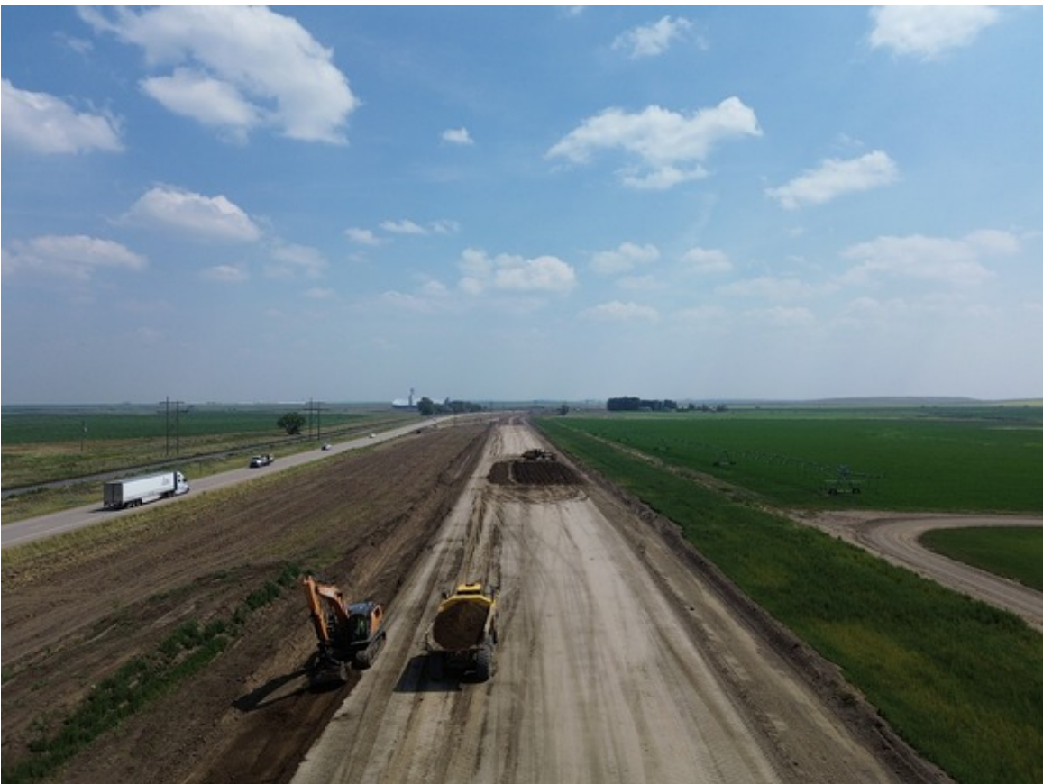
Grading Crews Final Subgrade Prepping Between RR 144 and 143