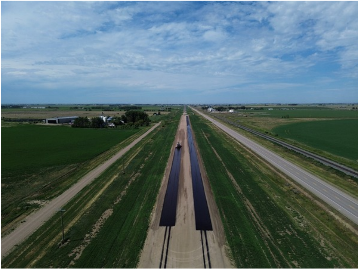
Gravel Crews Applying Prime Coat to Final Lift of Gravel Between RR 154 and 155