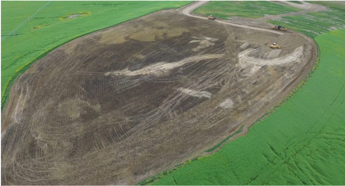
Grading Crews Completing Borrow Reclamation SE of RR 143