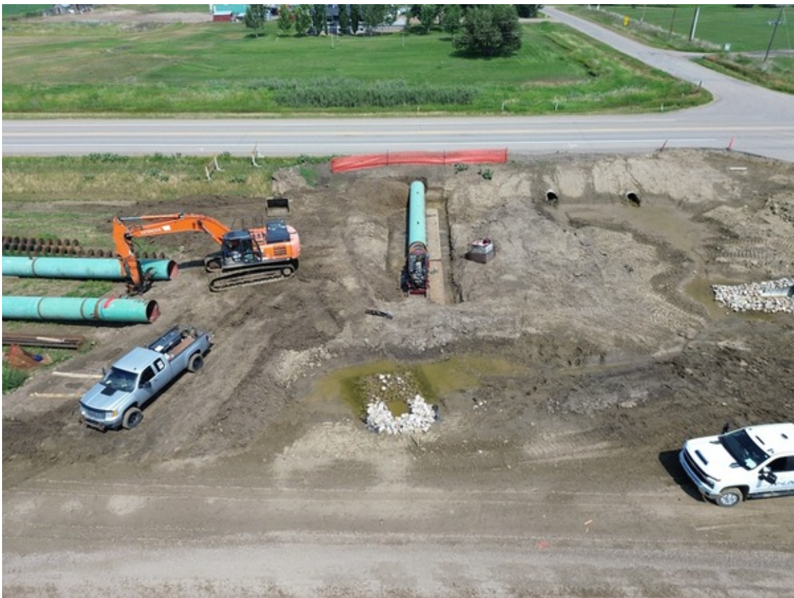
Culvert Crews Boring Underneath Existing Highway at RR 152