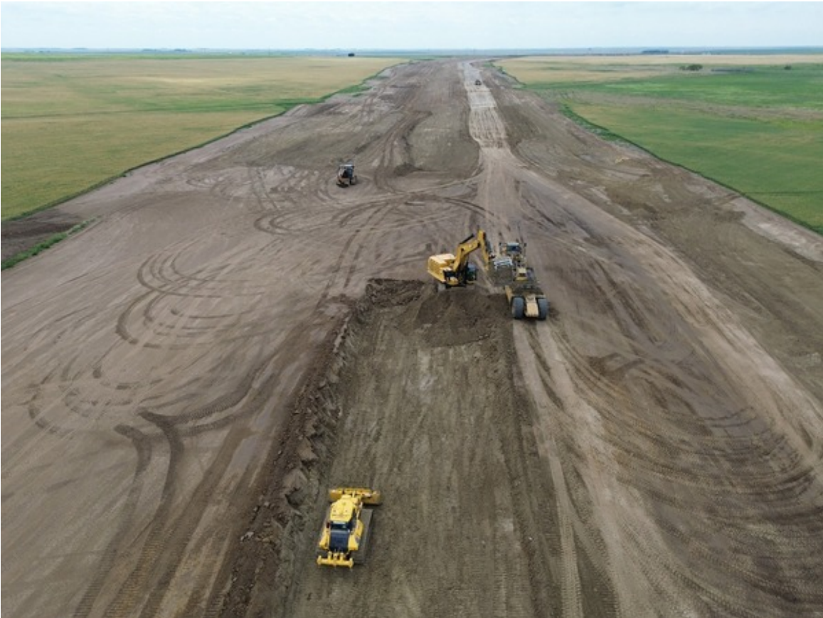
Grading Crews Completing Median Ditch Cut South of Grassy Lake