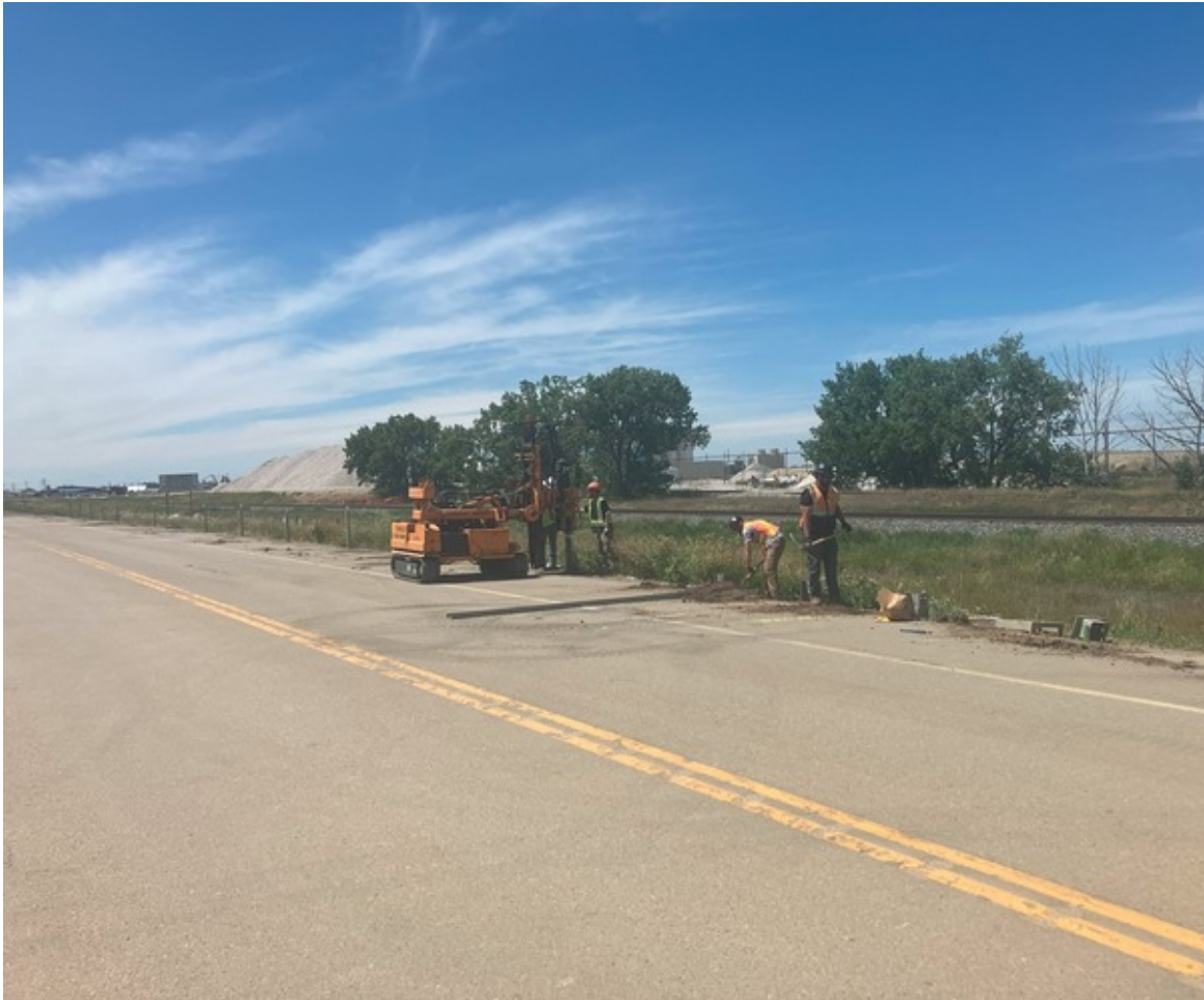
Guard Rail Crew Installing High Tension Cable Barrier Between Taber and RR 163