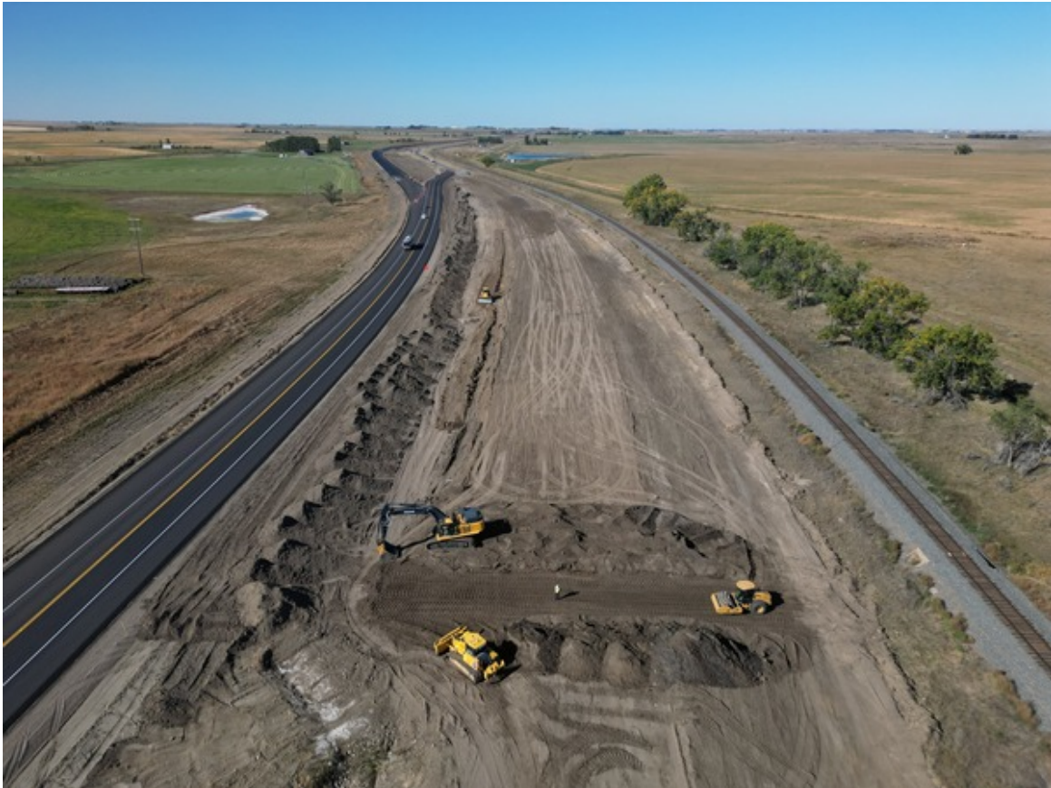
Grading Crews Installing Twin Centerline Culverts on Existing Highway 3 Curve Realignment Between RR 144 and 143 Looking West