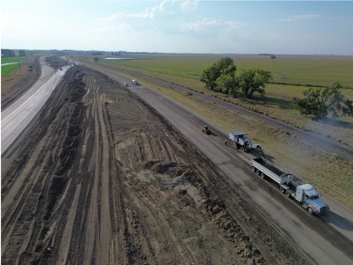
Asphalt Milling Crews Milling Existing Highway 3 Curve Realignment Between RR 144 and 143 Looking West