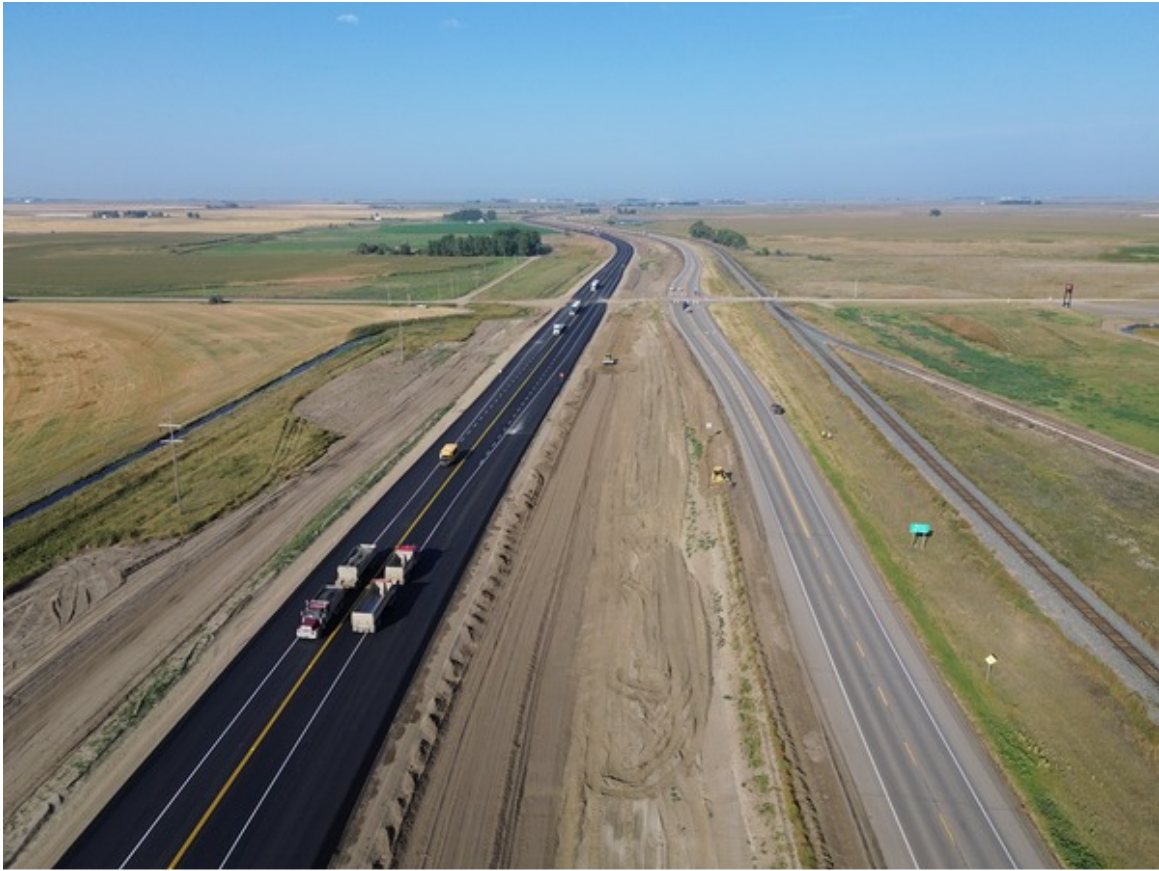
Traffic Detour Between RR 144 and 142 Looking West