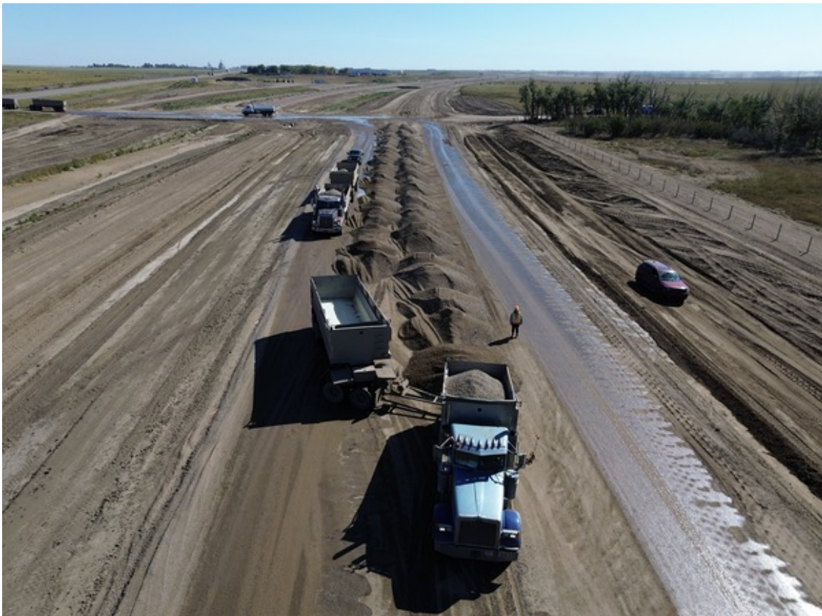
Base Crews Windrowing 2nd Lift of Gravel West of RR 135 Looking East