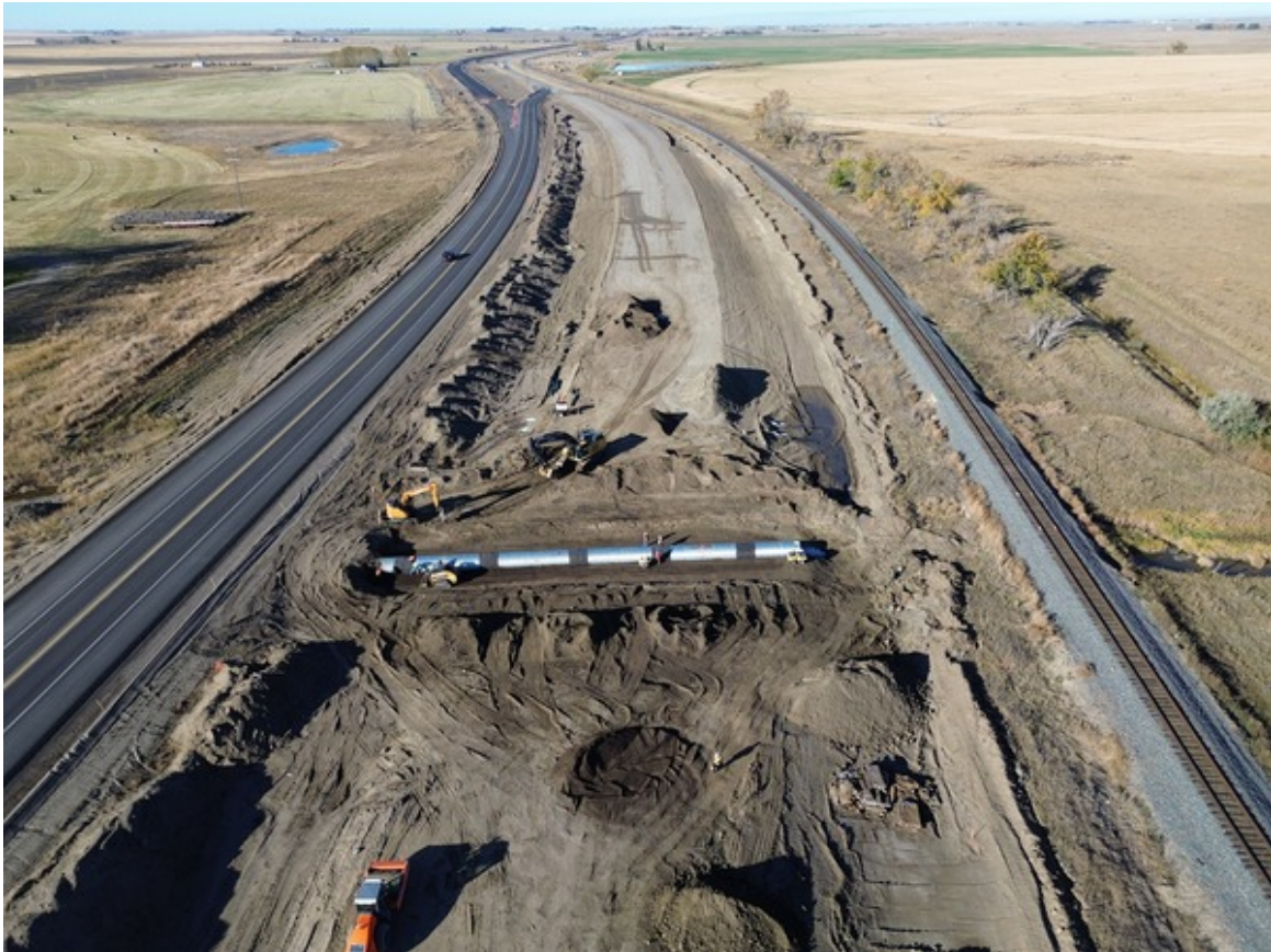
Crews Installing Bridge Sized Culvert on Curve Realignment Between RR 142 and 143 Looking West