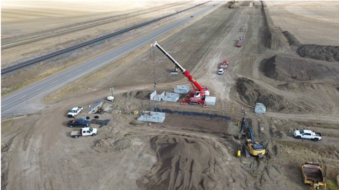
Crews Installing Precast Box Culvert on SMRID Channel Between RR 131 and 132 Looking East