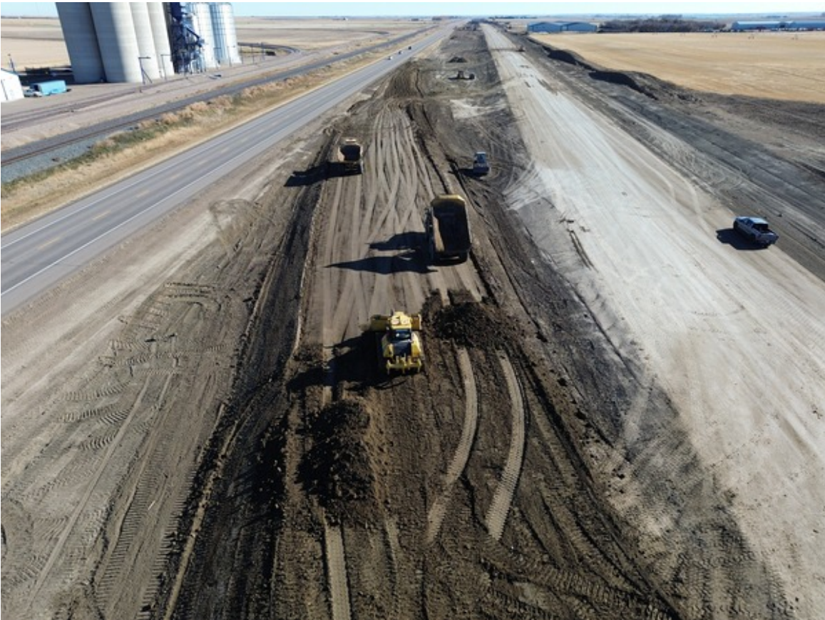
Grading Crews Working on East Grassy Detour Leg at RR 132 Looking East