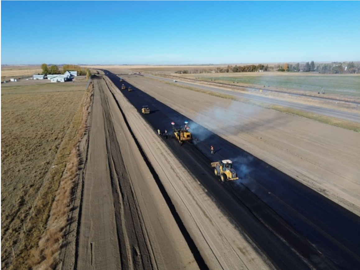
Paving Crews Working on 2nd Lift of Asphalt Between RR 135 and 134 Looking West