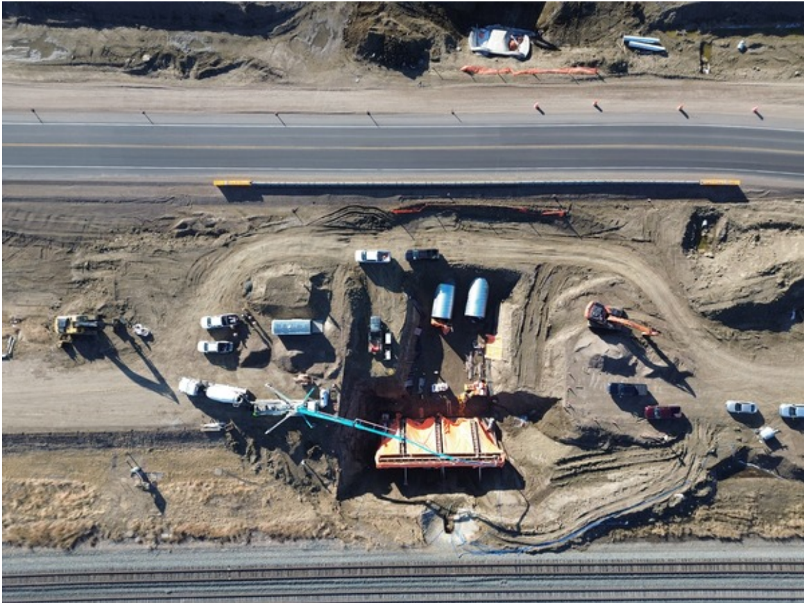
Crews Installing Twin 3.6m Culverts with Concrete Headwall East of Taber on Temporary Detour