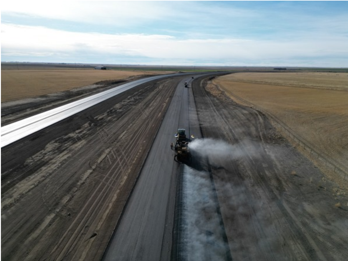
Paving Crews Placing 2nd Lift Between HWY 877 and RR 132 in the Bypass