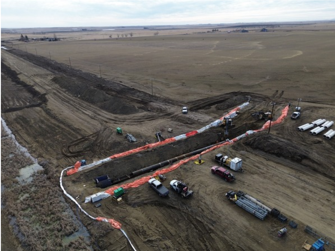
Crews Installing SMRID Casing and Dewatering Wellpoints at Purple Springs