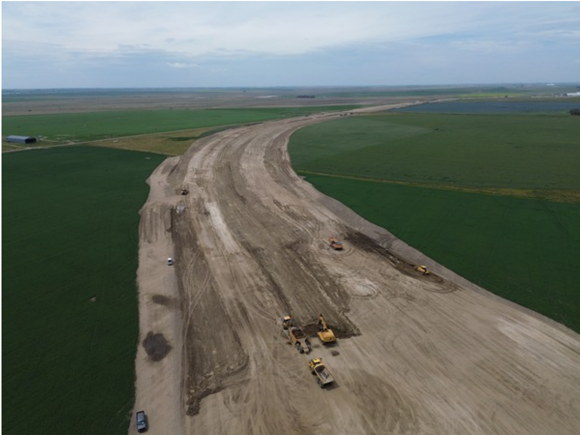
Crews Rough Grading in Bypass Between HWY 877 and RR 132