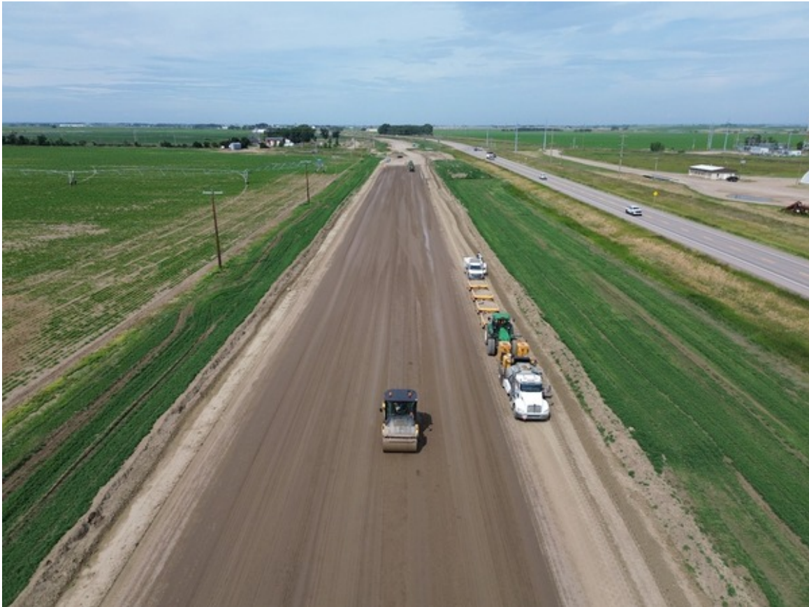
Base Crews Compacting 1st Lift Between RR 153 and RR 152