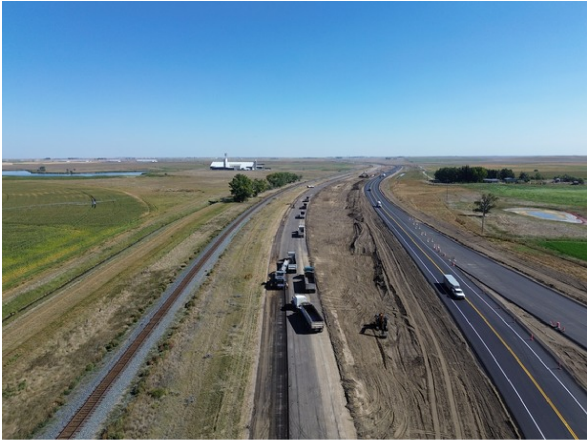
Milling Existing HWY 3 Curve Realignment Adjacent to Traffic Detour Between RR 144 and RR 142